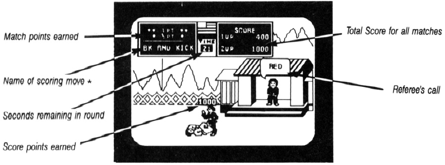
COMMODORE 64<sup>TM</sup> screen shown. Displays on APPLE II<sup>®</sup> may vary. *After each round, this area will show status of match.